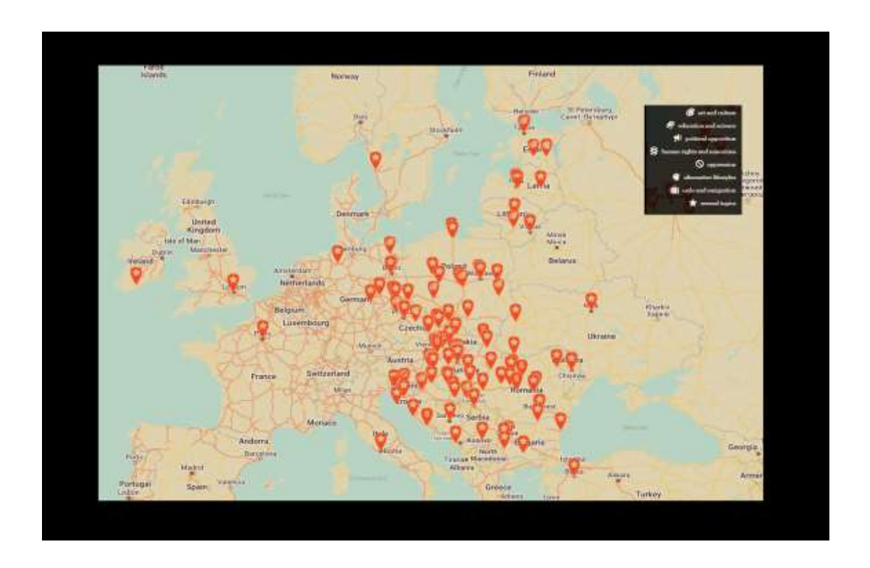
Figure 3. Geographical locations and topics of the collections in the COURAGE Registry

In the Registry, there are 36 different topics which can be assigned to collections and their contents. Multiple topics can be assigned to each collection.